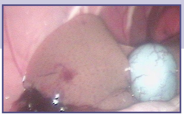
Liver and gall bladder