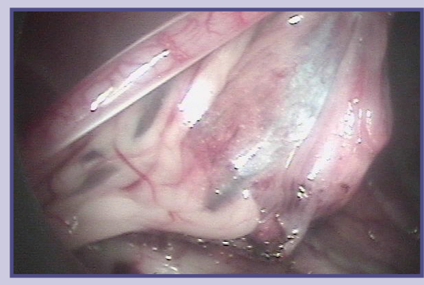
Ovary and uterine body after cautery used to seal blood vessels to the ovary.

The laparoscope can also be used to assist in traditional surgeries such as bladder surgery for stones, removal of a retained testicle in the abdomen. We can also document the appearance of certain organs or lesions with pictures taken by the laparoscopic camera.