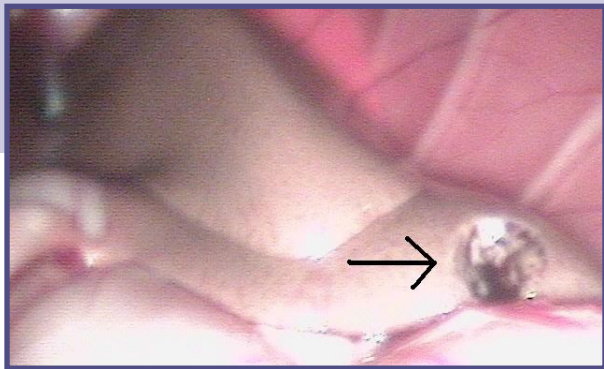
Liver after laparoscopic biopsy