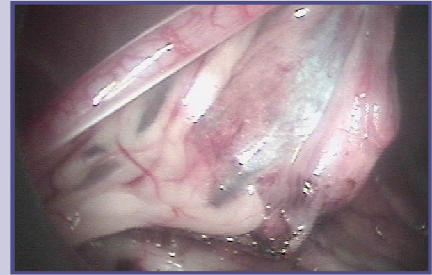
Ovary and uterine body after cautery used to seal blood vessels to the ovary.

The laparoscope can also be used to assist in traditional surgeries such as bladder surgery for stones, removal of a retained testicle in the abdomen. We can also document the appearance of certain organs or lesions with pictures taken by the laparoscopic camera.